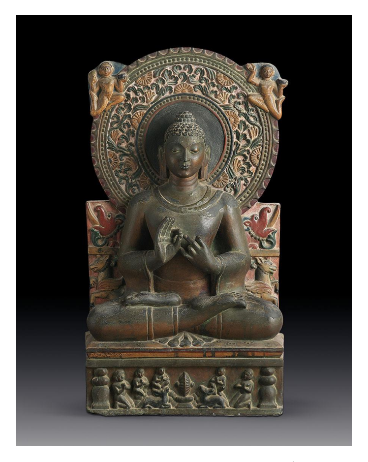
Stone stele of Gautam Buddha, from the 8<sup>th</sup> century

The property from the estate of the Maharaja of Burdwan is a magnificent stone stele of Gautam Buddha, from the 8^{th} century and is estimated between Rs 50 – 75 lakhs (lot 7).