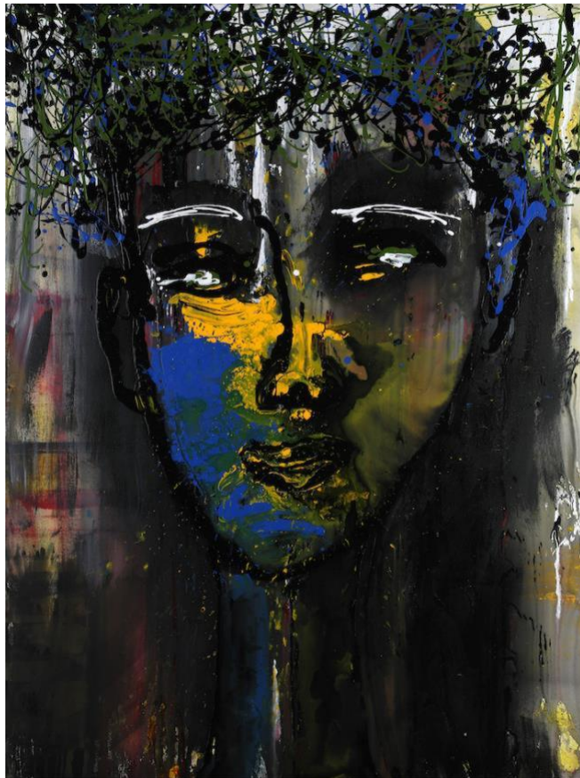
Bharat Thakur's 'Awash'

"The fire burnt so high and strong; A prayer soared to the mighty skies; Awash was the soul with showers; Pouring blue with soothing powers"