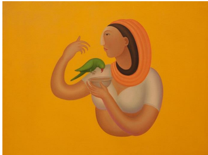
Lady with Parrot by Manjit Bawa

The selected highlights being a magnificent oil on canvas by the late Manjit Bawa (1941 – 2008) depicting a 'Lady with Parrot' against an ochre background, painted in 1998, reminiscent of his trademark bright Kalighat Patua style compositions. The work is estimated between Rs 90 lakhs – 1.2 crores.