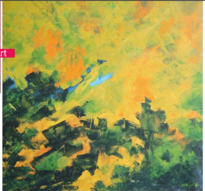
SH Raza - Untitled (Lot 53)