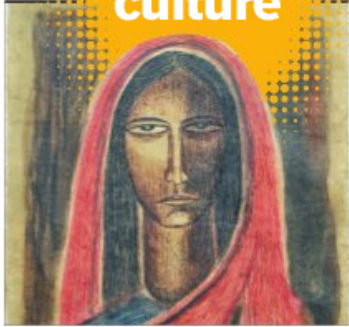
Rabindranath Tagore - Untitled (Lot 24)