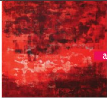
SH Raza - Untitled (Lot 53)